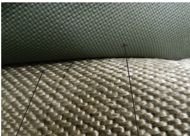
Woven Fiberglass Cloth 95oz sq. yard